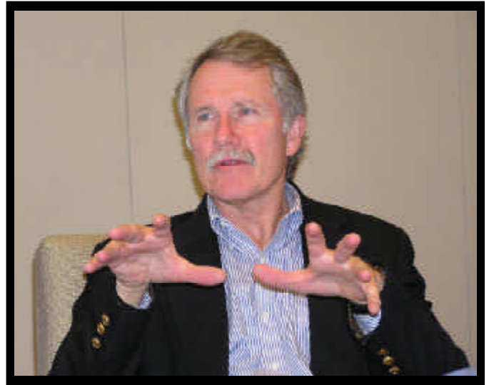
Former Governor Kitzhaber discusses natural resource issues in a recent meeting with Oregon Chapter Executive Committee officers.