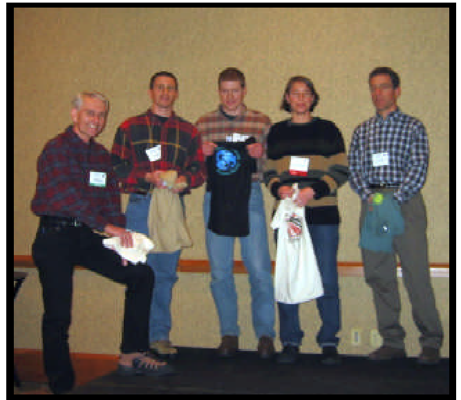
2004 Spawning Run winners with their cool t-shirt prizes!