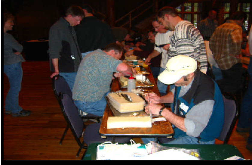
Participants get a “hands on” look at radio telemetry techniques in this pre-meeting workshop.