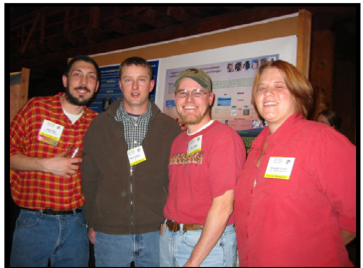
Oregon State students enjoy the upbeat atmosphere of the combined social and poster session at the 2004 Annual Meeting at Sunriver.