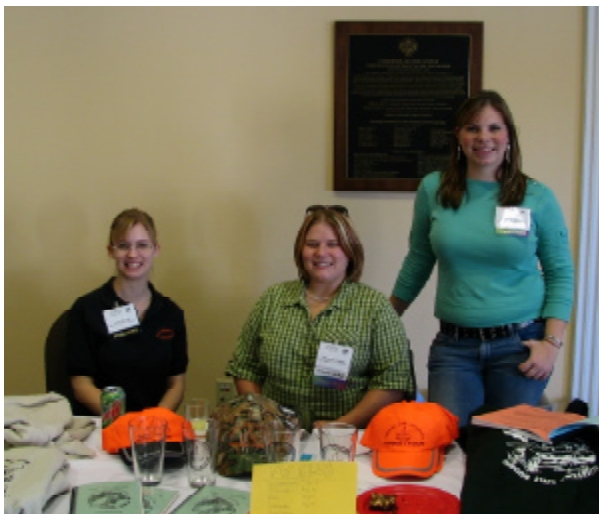
Members of the Fisheries & Wildlife Club sell club items during the 2005 Annual Meeting.

The "Match-the-Hatch" student-mentor session continues to be a slightly awkward but a very rewarding experience for students. I heard complaints from several students and one professional and they boil down to: