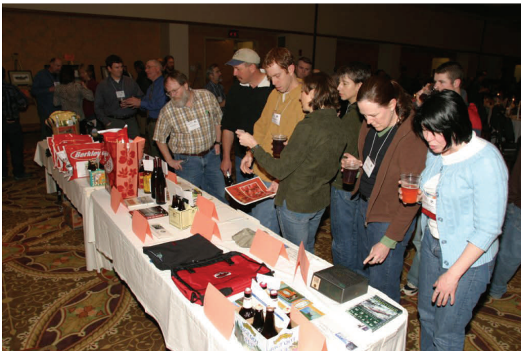
2007 Oregon AFS Annual Meeting participants previewing raffle awards during the annual Silent Auction and Raffle.

I used the sum of the “good” and “excellent” ratings as an index of approval (even though “fair” doesn’t imply disapproval...does it?). The overall approval rating for the annual meeting was >82%. Electronic registration, meeting location, room quality, meeting rooms, plenary sessions, technical sessions, the poster session, the raffle and auction, social events, and Texas Hold ‘em all ex-