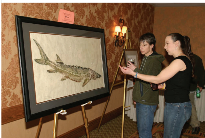
Meeting attendees discuss an auction item during the Auction and Raffle Social at the 2007 Oregon Chapter AFS Meeting.