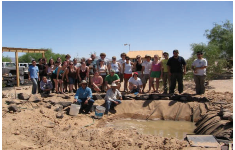
Oregon State University Fisheries and Wildlife Club assisting with the construction of artificial ponds for endangered desert pupfish ( Cyprinodon macularis ) at the El Pinacate Biosphere Reserve—Puerto Penasco.