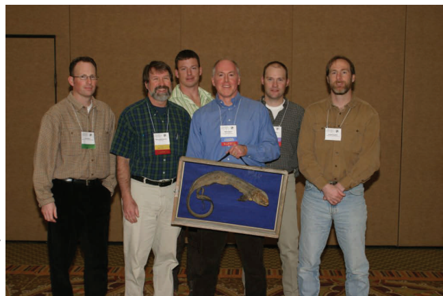
Members of the Oregon AFS ExCom display the wolf eel and its new display case.

Please take the time to thank those that have volunteered for the Chapter. If you have an interest in being a volunteer, please contact me.