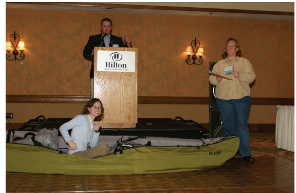
Volunteers assisting with the auction and raffle during the 2007 Oregon Chapter AFS Meeting.

Lastly, for those of you that may or may not know, a part of our