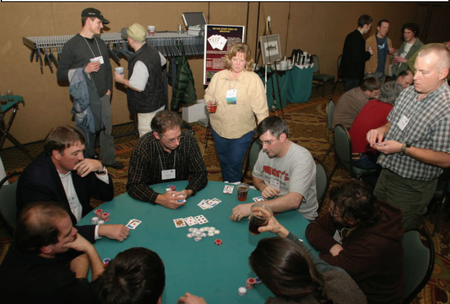
Texas Hold'em participants testing their skills during the 2007 Oregon Chapter AFS Meeting.