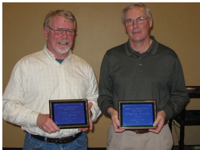
Central Oregon Flyfishers and Sunriver Anglers were presented Award of Merits for sustained dedication to conservation and work benefitting native fish.