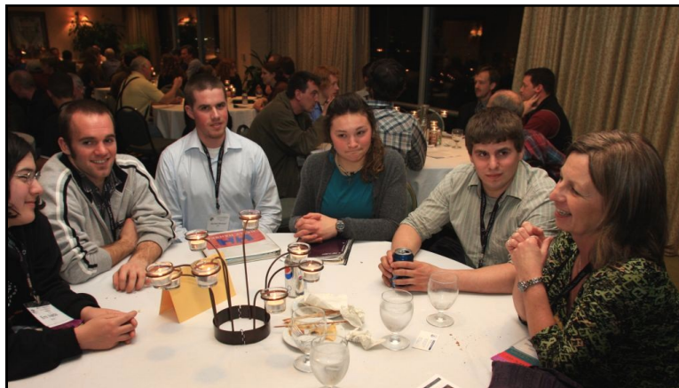
Small groups of students meet with representatives of potential employers during the Student-Mentor Mixer