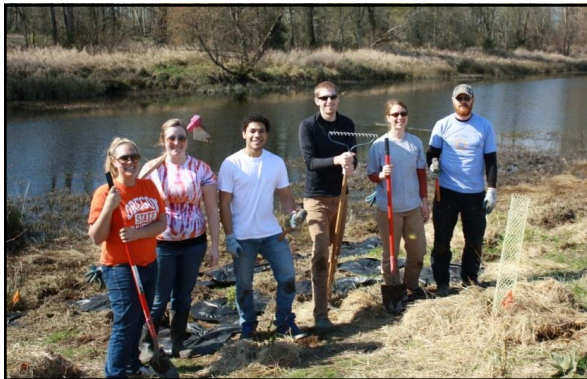
FW Club members on a tour hosted by the McKenzie