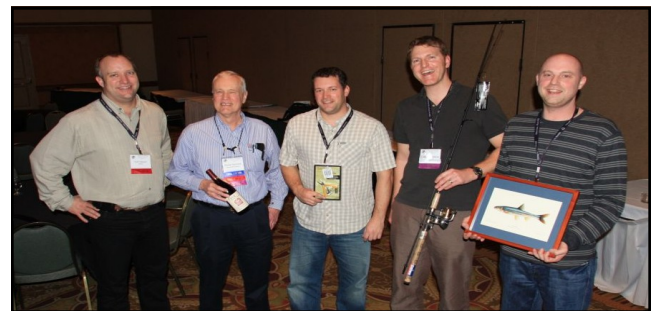
Poker tournament players show off their prizes.