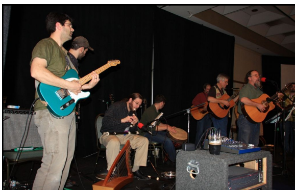
Band members jam after the banquet.