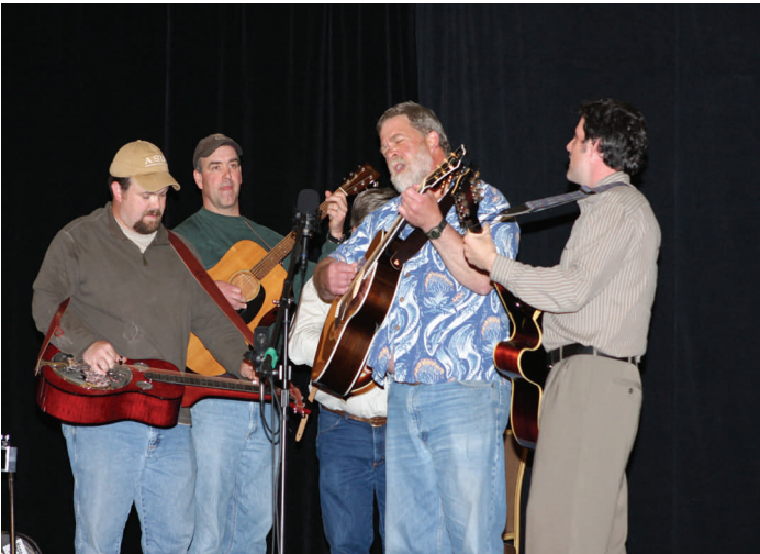
New to this year's meeting was the Jam Session. Due to its success, plan on seeing an encore performance in 2009!