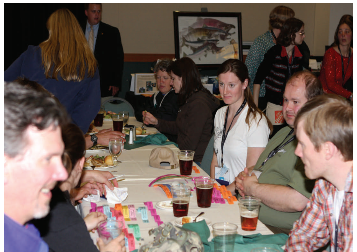
The Oregon Zoo proved to be the perfect venue for the banquet, raffle and auction as attendees enjoyed outstanding food, sights, and entertainment.