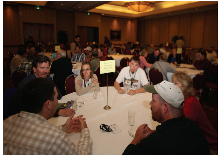
Back by popular demand, the Student-Mentor Social provided professionals and students an opportunity to exchange information.