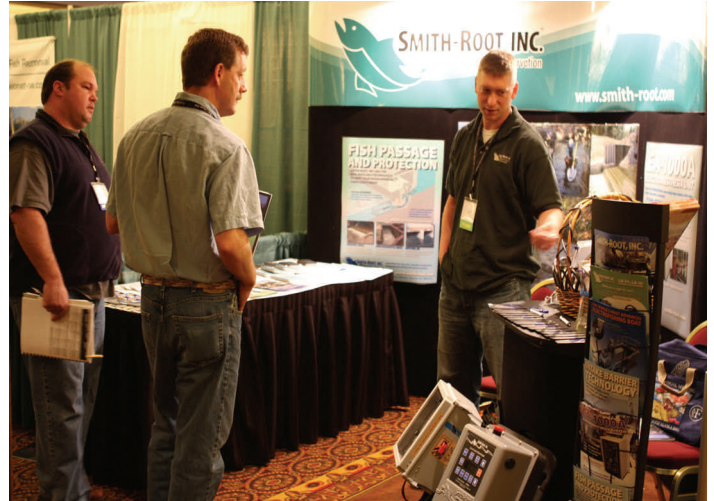
Meeting attendees visiting with Smith-Root representatives during the Trade Show Social. Attendees were treated to an expanded Trade Show during 2008 Annual Meeting.