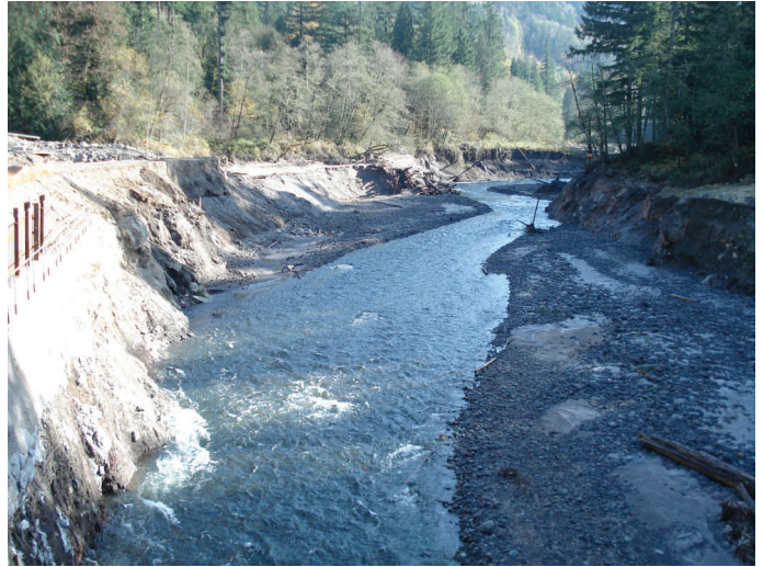
Figure 2. Photo of Sandy River flowing through the former site of Marmot Dam, three weeks after breaching the coffer dam.

isolated in the one kilometer reach between the lower coffer dam and the picket weir. Biologists trapped or captured over 1,700 wild and nearly 900 hatchery salmon and steelhead between when accessed. On October 18 th , significant rains fell on several inches of snow in the north