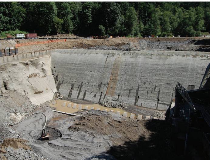
Figure 1. Photo of Marmot Dam just prior to the initial explosion.

Removal of Marmot Dam was the first step in deconstruction of the Bull Run Project, and was initiated in July of 2007. PGE contractors began in-water work by isolating Marmot Dam from the Sandy River with earthen coffer dams just above and below the dam, thereby diverting the river around Marmot Dam. Demolition of the concrete dam began with a well publicized explosion on July 24 th . Crews then methodically removed the dam and adjacent fish ladder from the top down through a series of explosion-material removal cycles, and their work was essentially completed by the end of September.