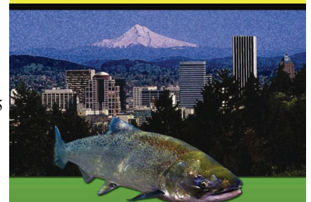
HUMAN POPULATION GROWTH AND FISHERIES: THE WESTERN CHALLENGE

American Fisheries Society Western Division Annual Meeting